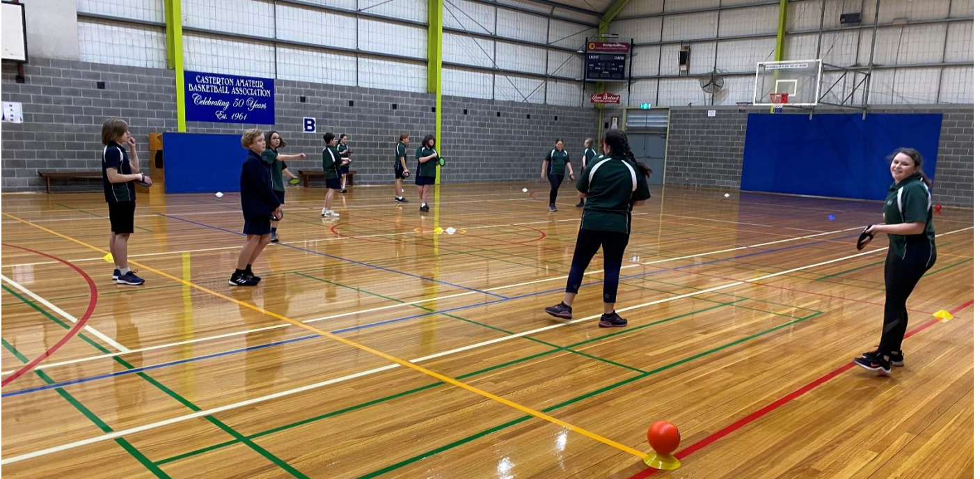
Yr. 7N class

Currently the Year 7N class is exploring different invasion games. They have started this unit looking at where to move and defend in modified versions of 'keepings off'.